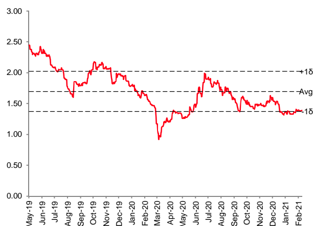
EXHIBIT 3: PE BAND CHART